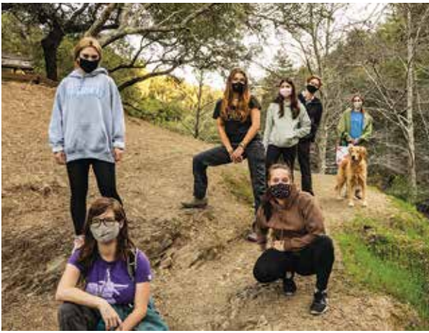
Audubon Society volunteers take a break from building the garden paths.