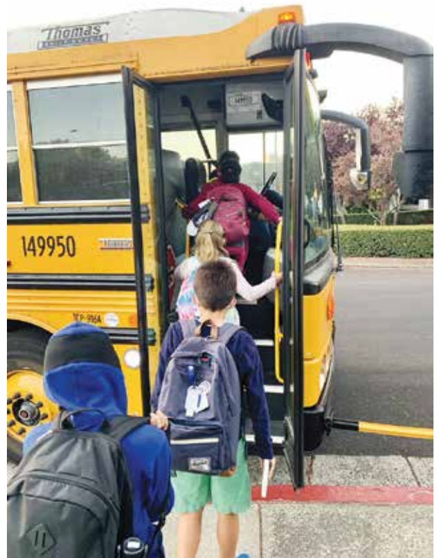
Students board the Yellow Bus at the Teal Rd stop.