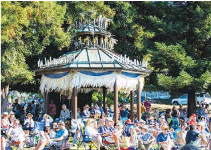
Above: 125th Birthday decorations add a festive note to September's concert. Right: Foreverland gets the crowd dancing.