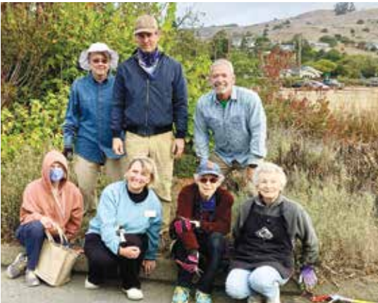
Harvey's Garden volunteers take a break from pruning and planting.

This year's drought challenged the Green Team at the Trestle Trail Wildflower Meadow and the gardeners at Harvey's Garden at Blackie's Pasture. Planting drought-tolerant California natives refreshed both areas. BCF grants helped both groups adopt new watering protocols; the Green Team developed a system to transport recycled water to areas of need along Trestle Trail, while Harvey's Garden acquired a new smart irrigation system. On your next walk along the shoreline, stop by both areas and see what tickles your gardening fancy.