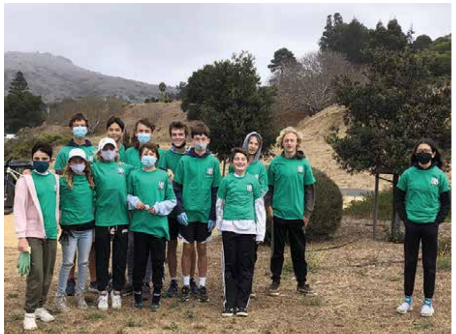
TeenWorks volunteers get ready for Coastal Clean-up Day.

BCF made two grants to The Ranch in 2021. The first provided scholarships for a week of summer camp for fifteen local families in need. The second covers expenses for TeenWorks, a free community service program for local teens that provides various volunteer opportunities on the Peninsula. After a pandemic-induced hiatus, TeenWorks returned with thirteen eager volunteers picking up trash along Blackie's Pasture shoreline during September's Coastal Clean-up Day.