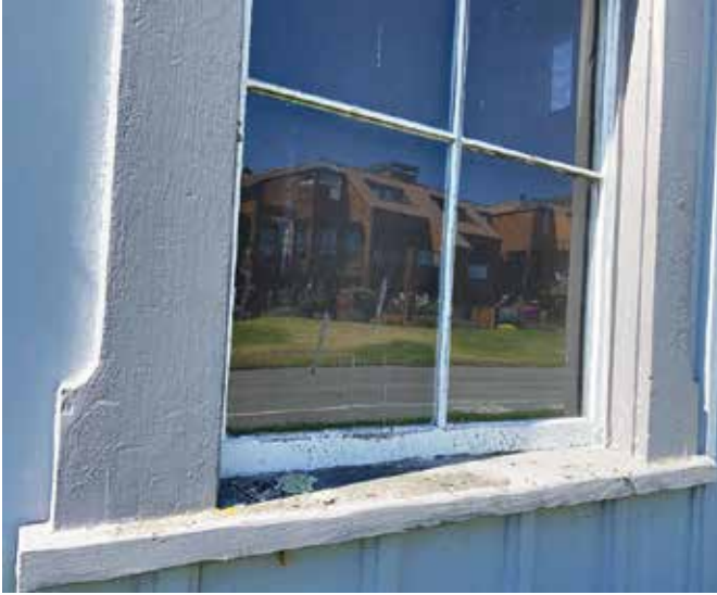
Above: Point Tiburon is reflected in a Depot window slated for repair. Right: the Depot in 1962 (from landmarksociety.com).

Years of salt air and bird droppings have done their worst to the Depot's windows; almost every window needs work. The Landmarks Society is awaiting a permit and hopes to have the work completed before the rains come. BCF is delighted to join with the Town of Tiburon and