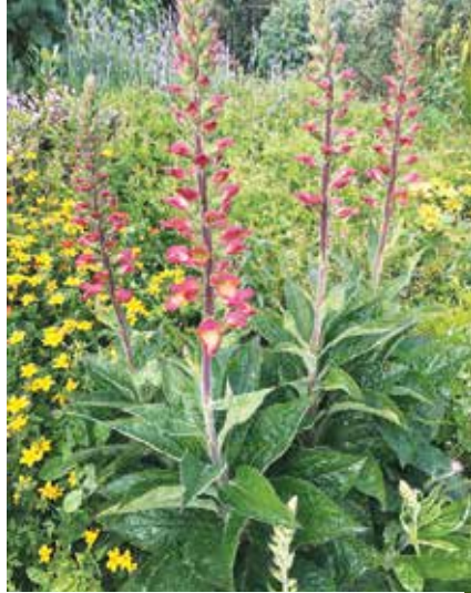
At Harvey's Garden (above and right), Trestle Trail (below) and Richardson Bay Audubon Center (bottom), volunteers now follow COVID-19 protocols to keep our Peninsula verdant.