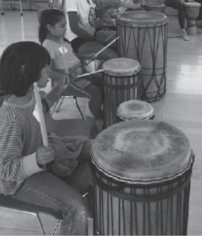
Campers learn that making music is Better Together