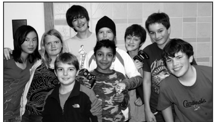
Local teens take a break in The Zone

To help achieve that goal, the Belvedere Community Foundation recently approved a $2,500 grant to the Belvedere Tiburon Recreation for the purchase of additional equipment. The shopping list for The Zone