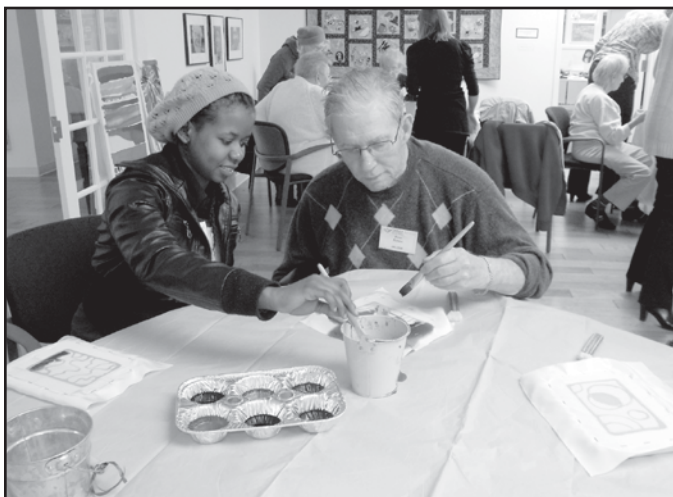
A Senior Access staff member and participant work on silk panels at the San Rafael program.

Senior Access received a two-stage $20,000 grant from the Belvedere Community Foundation to support the creation of an Adult Day Program at St. Stephen's Church in Belvedere. The grant funded the start-up costs of the program including outreach and education, administrative and activity supplies, meal service, locked cabinets for storage, and scholarships for low to moderate income older adults.