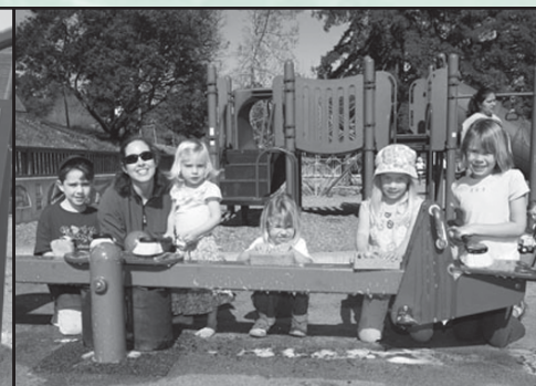
Belvedere Nursery School participating in Clean and Green Day