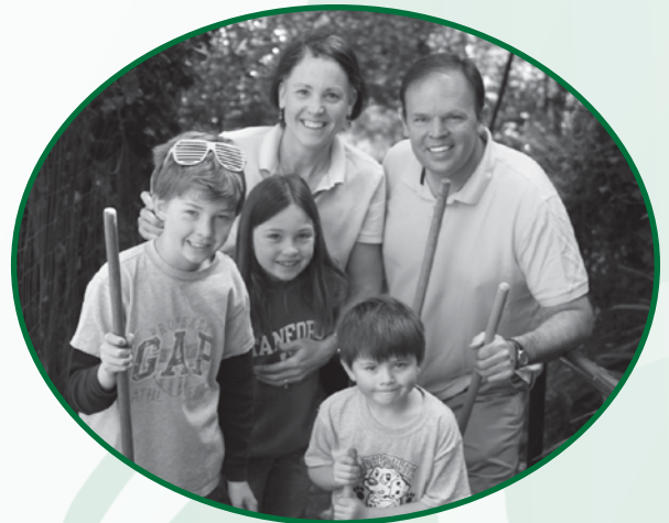
The Young Family