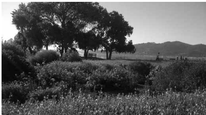
Photo caption: Walkers and cyclists get to enjoy the sight of Blackie's Garden as they begin their walk along the bike path.

The Belvedere Community Foundation was pleased to offer its continued support of the Peninsula's largest and most prolific public garden – "Blackie's Garden." The 8,000 square foot raised bed, located near the parking lot at Blackie's Pasture, is the result of Harvey Rogers' dedication and endless energy. As a Belvedere Master Gardener, Harvey has coordinated volunteers for the past 15 years in planting and maintaining the garden's 2500 plants. In addition to being a magnificent color spot, the plant labels and educational materials kept on site offer a superb educational opportunity for students, gardeners, homeowners and flower lovers. For more information, contact Harvey Rogers at (415) 435-4498 or harvnan2@sprynet.com or tiburonpeninsulafoundation.org/blackies-garden.php .