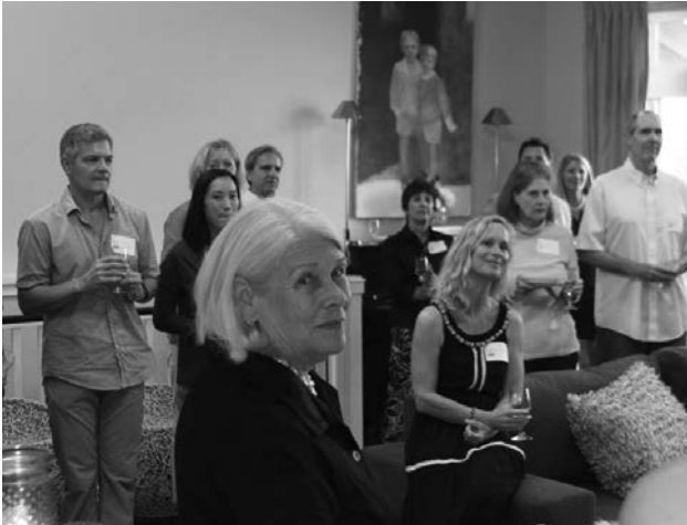
Newcomers are welcomed to the neighborhood.