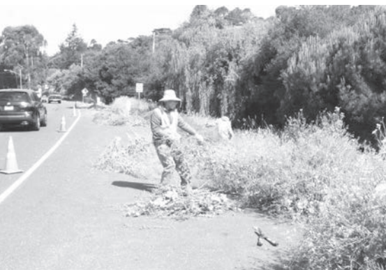
Tiburon Peninsula Green Team beautifies Tiburon Boulevard/Highway 131.