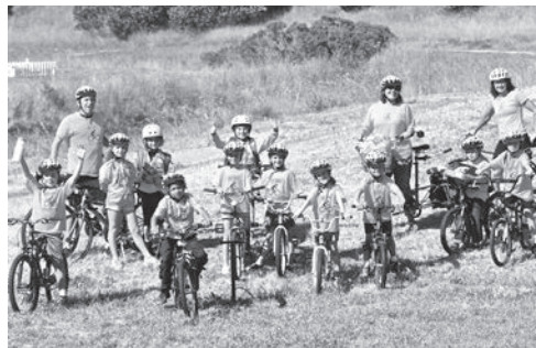
WheelEscape's Orange Bike Team rides to and from Reed District schools.

The Belvedere Community Foundation is fortunate to have strong support from residents to fund grants for many local projects.