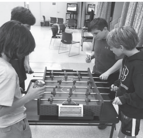
Teens play foosball at The Hangout hosted by The Ranch.