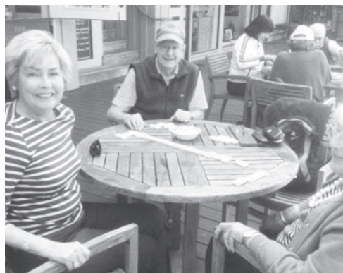
Tiburon Peninsula Village members play dominoes in the courtyard at the Boardwalk.