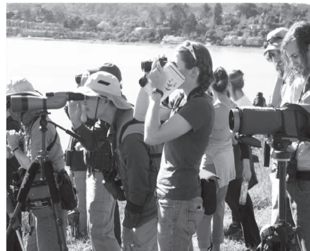
Richardson Bay Audubon Center & Sanctuary hosts its second annual Waterbird Festival.

The following pages highlight several of the groups which applied for and received grants from the BCF this past year. Also included are events funded by BCF to foster a sense of community, and welcome our newest neighbors to Belvedere.